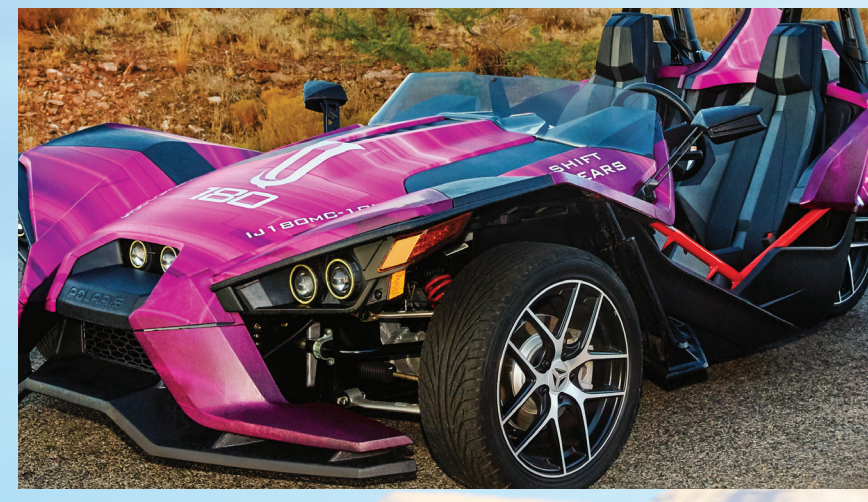
▲ Push your removals into hyperdrive.