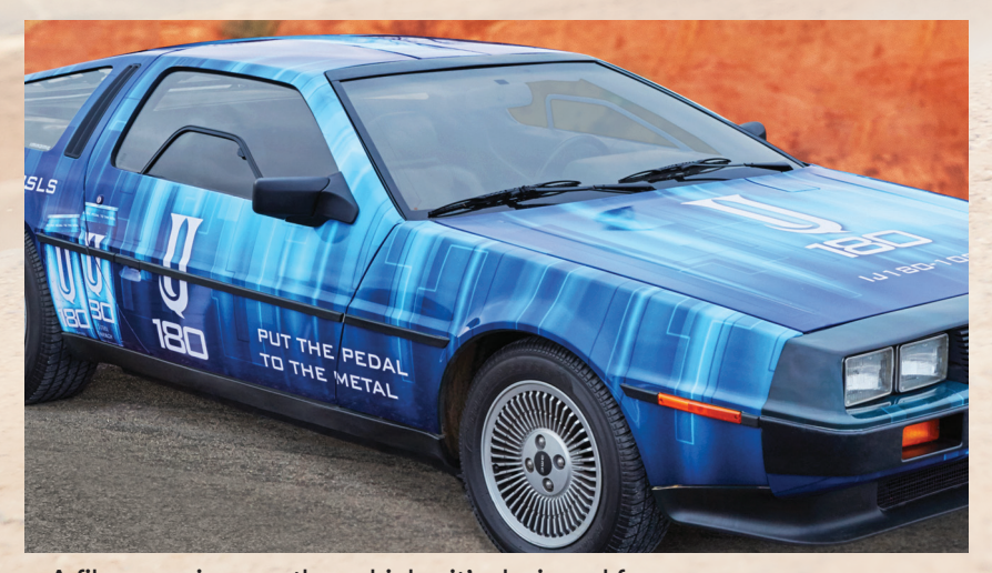
▲ A film as unique as the vehicles it's designed for.