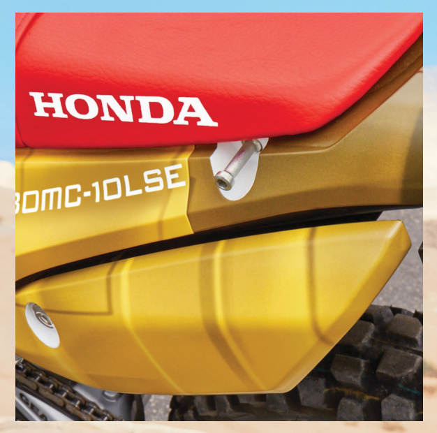
▲ Go to extremes with rugged wraps that hold up to the toughest rides.